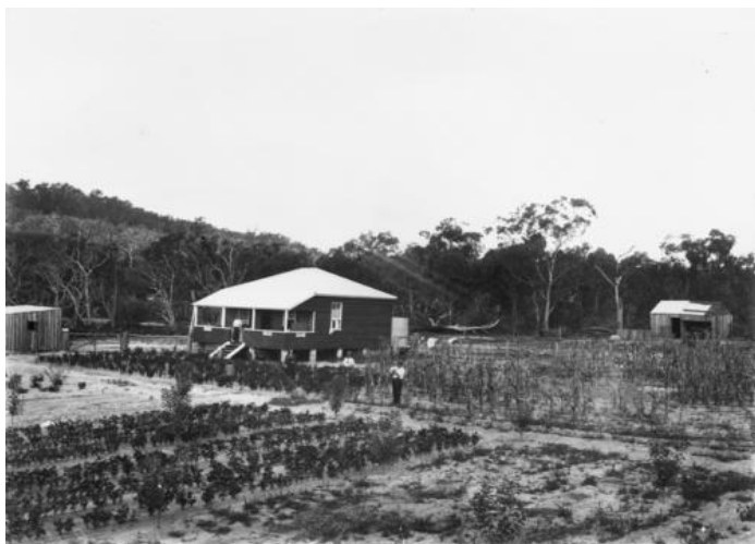
Gardiner farm at Bracker's Swamp, Amiens.